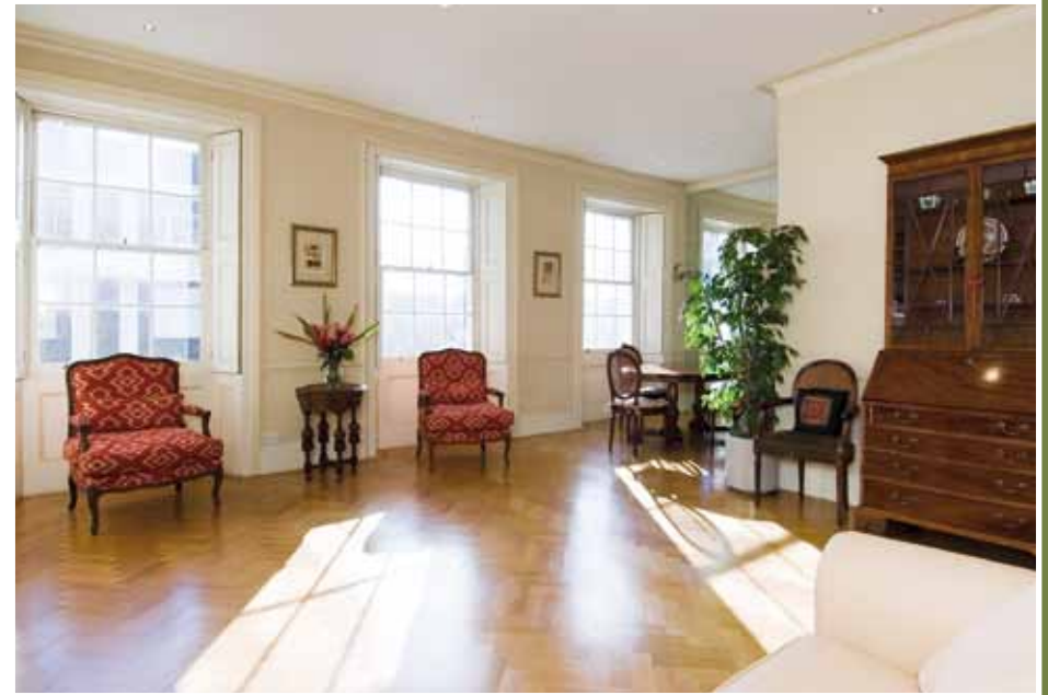
As previously furnished